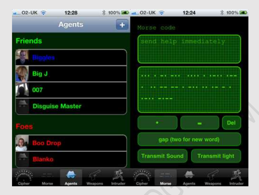
Self Destructing Message

Self Destructing Message (SDM) is a message app along the lines of Viber or Whatsapp. However, with this app you'll be able to set 'self destruct' timers to your messages. Your friend will have 5, 10, 15, 30 or 60 seconds to read the message that you sent. After that, the message 'self destructs' (gets deleted).