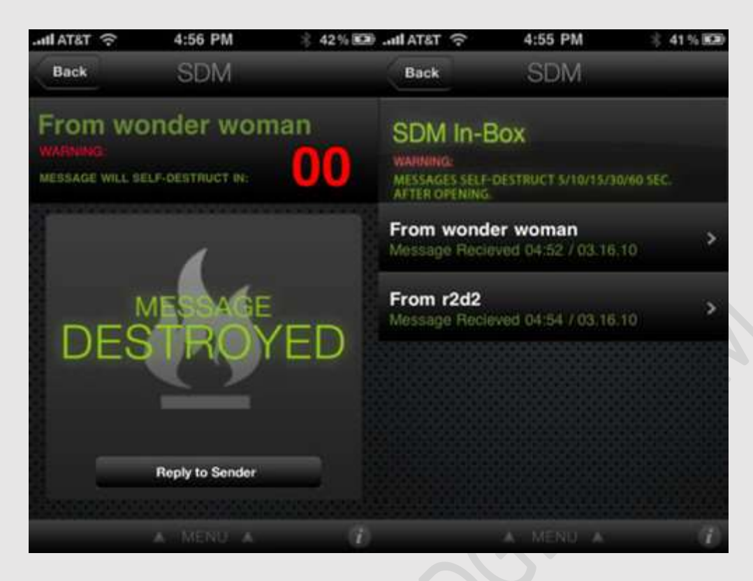
Your Secret Folder

This app acts like a secret folder to manage private photos and videos. It protects your files with either a 4 number PIN lock or a dot lock. The options they give you include taking a photo with the front camera when someone attempts to unlock the app. There is also the option to include a fake password.