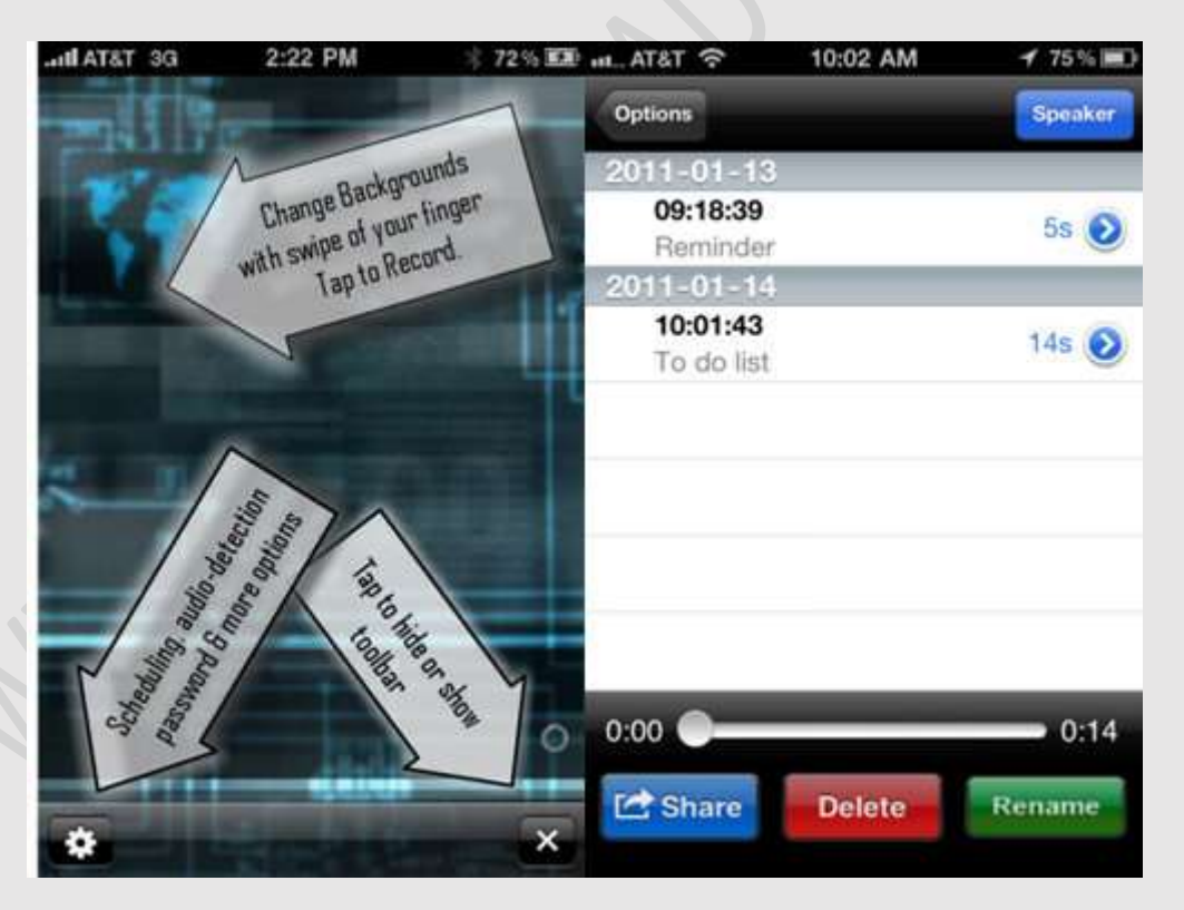
Secret Spy Camera Pro

Top Secret Audio (TSA) Recorder works like a picture-viewing app where you swipe left and right to view different pictures. However, the app starts recording the moment you tap on the picture. You can add your own pictures or use the ones that came with the app. Since there is no recording interface, no one will know that you are recording audio. You can also passcode lock your recorded files for added security. Files can then be shared or extracted through iTunes. [Free]